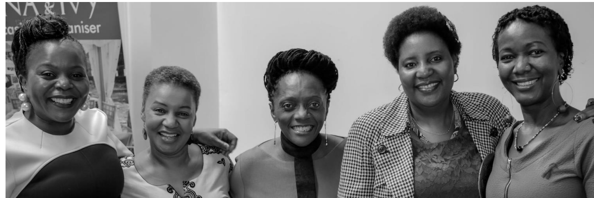
Photo: Women living with HIV who've been Meaningfully Involved & Engaged in research