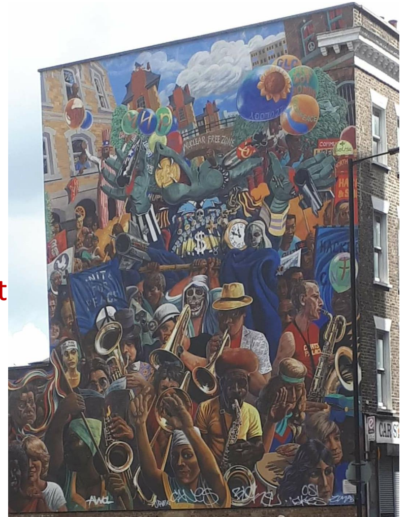
Hackney Peace Carnival Mural in Dalston