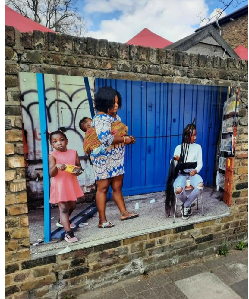
Photograph from Ridley Road Stories Exhibition